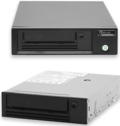
Overland-Tandberg's LTO tape drives are available as internal and external drives

Overland-Tandberg LTO Ultrium tape drives are just one of many products in an entire line of NEO LTO-based storage solutions. Whether you need the simple storage capacity of a single tape drive, or the convenience, reliability, data availability and superior cost of ownership of a NEO Series LTO automated tape library, Overland-Tandberg has the solution that's right for you.