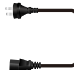
AC Power Cable