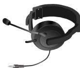
Professional Moving-coil Side-ear Headset